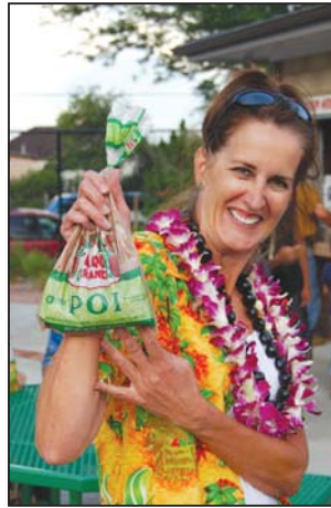
The Aloha Spirit filled Walsenburg Wild Waters Friday evening for a benefit concert and auction.